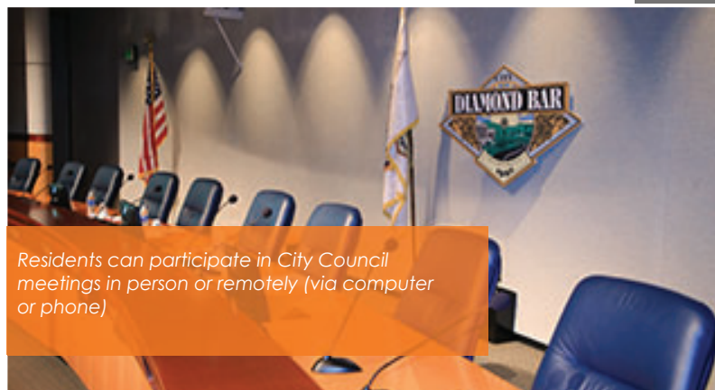
Residents can participate in City Council meetings in person or remotely (via computer or phone)